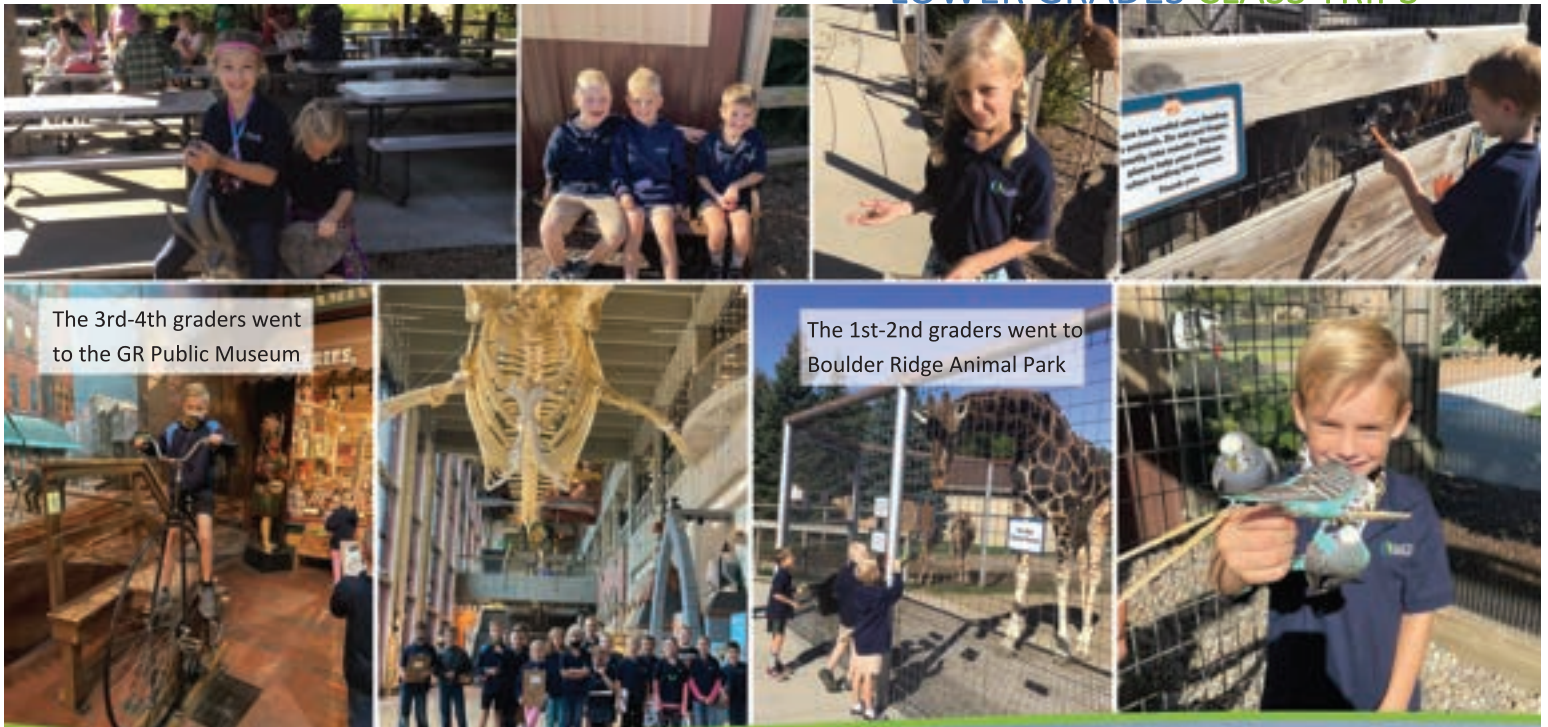
The 3rd-4th graders went to the GR Public Museum